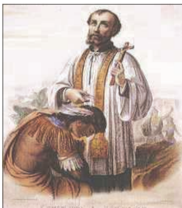
St. Francis Xavier

490 Bench Street Taylors Falls, MN 55084