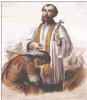
St. Francis Xavier

490 Bench Street Taylors Falls, MN 55084