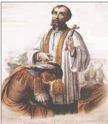
St. Francis Xavier