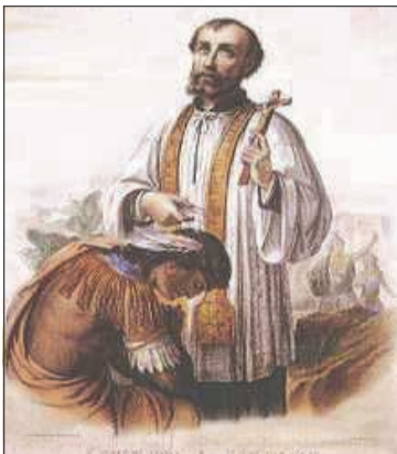
St. Francis Xavier

490 Bench Street Taylors Falls, MN 55084