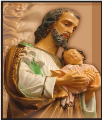
St. Francis Xavier 25267 Redwing Avenue Shafer, MN 55074

St. Joseph 490 Bench Street Taylors Falls, MN 55084