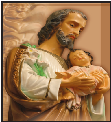
St. Francis Xavier 25267 Redwing Avenue Shafer, MN 55074

St. Joseph 490 Bench Street Taylors Falls, MN 55084