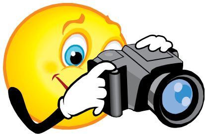
PHOTO – VIDEO RELEASE: I hereby give permission for my son(s)/daughter(s) to be photographed or videotaped at St. Joseph parish. I realize that photos may be published in the parish bulletin, newsletters, website, Facebook or bulletin boards. Generally, we don't publish last names with photos. The photos/video may be used for informational or educational purposes regarding the programs or curriculum at St. Joseph Church.

Or mail to: Church of St. Joseph, PO Box 234, Taylors Falls, MN 55084. -----