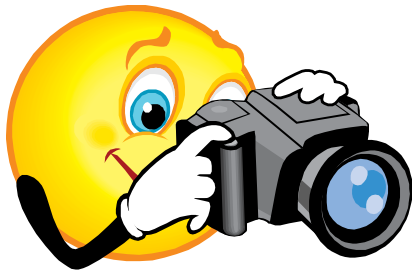
PHOTO – VIDEO RELEASE: I hereby give permission for my son(s)/daughter(s) to be photographed or videotaped at St. Joseph parish. I realize that photos may be published in the parish bulletin, newsletters, website, Facebook or bulletin boards. Generally, we don't publish last names with photos. The photos/video may be used for informational or educational purposes regarding the programs or curriculum at St. Joseph Church.

Please return this form and a check made payable to the Church of St. Joseph. Or mail to: Church of St. Joseph, PO Box 234, Taylors Falls, MN 55084. -----