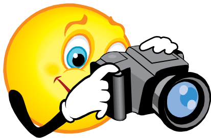
PHOTO – VIDEO RELEASE: I hereby give permission for my son(s)/daughter(s) to be photographed or videotaped at St. Joseph parish. I realize that photos may be published in the parish bulletin, newsletters, website, Facebook or bulletin boards. Generally, we don't publish last names with photos. The photos/video may be used for informational or educational purposes regarding the programs or curriculum at St. Joseph Church.

SIGNATURE OF PARENT/GUARDIAN _____ DATE _____