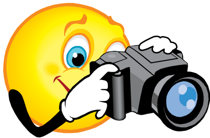
PHOTO – VIDEO RELEASE: I hereby give permission for my son(s)/daughter(s) to be photographed or videotaped at St. Joseph parish. I realize that photos may be published in the parish bulletin, newsletters, website, Facebook or bulletin boards. Generally, we don't publish last names with photos. The photos/video may be used for informational or educational purposes regarding the programs or curriculum at St. Joseph Church.

Or mail to: Church of St. Joseph, PO Box 234, Taylors Falls, MN 55084.