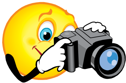
PHOTO – VIDEO RELEASE: I hereby give permission for my son(s)/daughter(s) to be photographed or videotaped at St. Joseph parish. I realize that photos may be published in the parish bulletin, newsletters, website, Facebook or bulletin boards. Generally, we don't publish last names with photos. The photos/video may be used for informational or educational purposes regarding the programs or curriculum at St. Joseph Church.

SIGNATURE OF PARENT/GUARDIAN _____ DATE _____