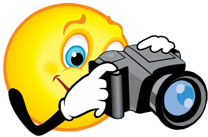
PHOTO – VIDEO RELEASE: I hereby give permission for my son(s)/daughter(s) to be photographed or videotaped at St. Francis Xavier parish. I realize that photos may be published in the parish bulletin, newsletters, website or bulletin boards, Facebook. Generally, we don't publish last names with photos. The photos/video may be used for informational or educational purposes regarding the programs or curriculum at St. Francis Xavier Church.

SIGNATURE OF PARENT/GUARDIAN _____ DATE _____